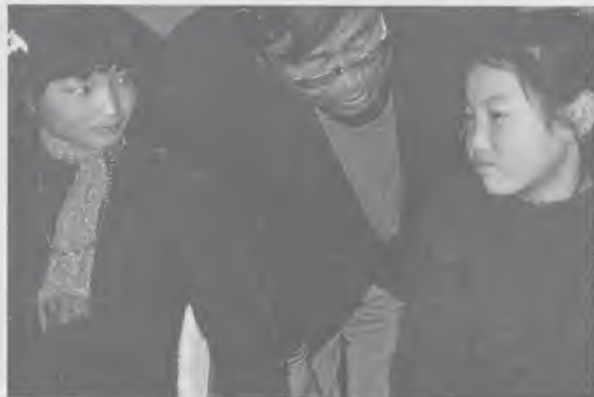
TWO CHINESE CHILDREN with alleged psychic powers and their mentor. Under his tutelage, the children are supposedly able to read characters on pieces of paper stuffed in their ears or armpits or sealed in envelopes. They were unable to duplicate the feats under CSICOP-controlled conditions.